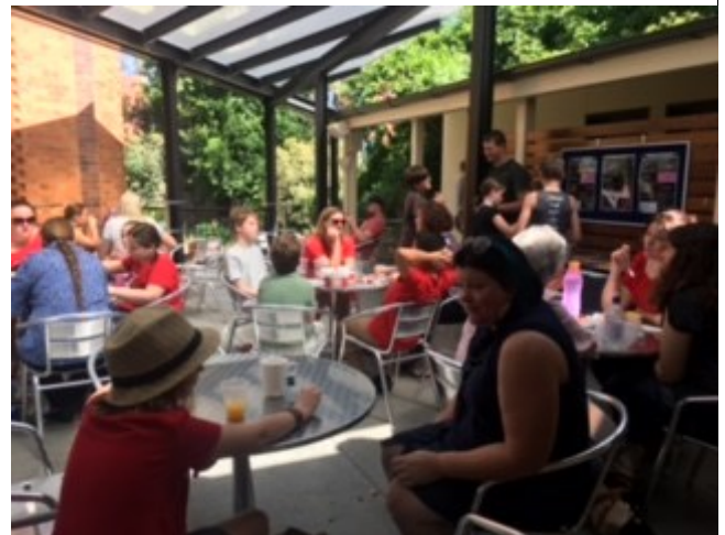
The Junior celebrations in the courtyard

The group also celebrated the end of another successful year with a morning gathering in the theatre courtyard where certificates and awards were presented. A number of the students will be moving on to Young Theatricals next year.