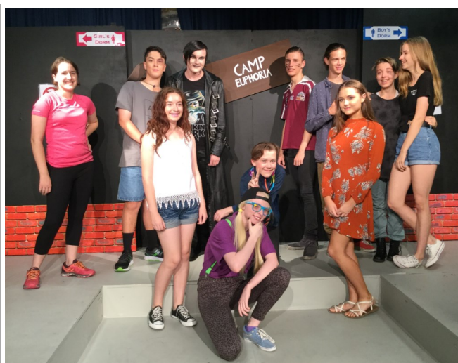
The cast of Camp Euphoria