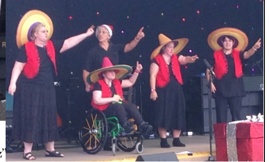
L: "Three Kings" Centre: "Silent Night" Top R: "Tannenbaum" Bottom R; "Feliz"