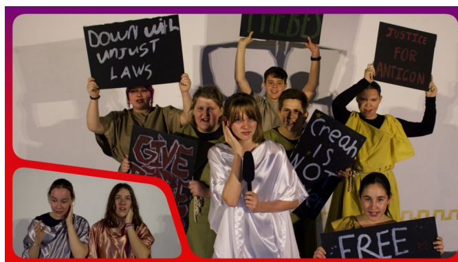
A publicity poster for Antigone 3021 .

On Sunday 2 June, the cast and crew of Stepping Out bumped out and stepped out, allowing the YTs to step in and bump in. A few modifications to the previous set, and the Theatre became their "home" for the next few weeks. The youngsters are thrilled to be acting on "the big stage".